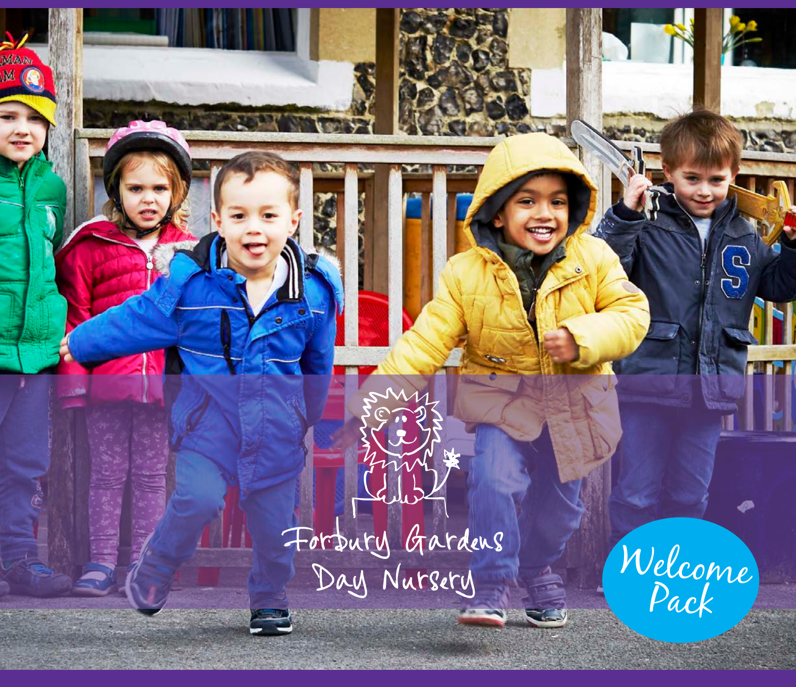
Letter to all parents - Nursery Fees May 2023 - Enrolment Form - Additional Information